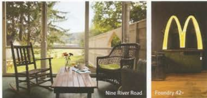
Nine River Road